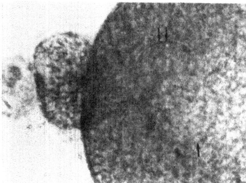
Figure 2. An ovum with male (one arrow) and female (two arrows) pronuclei just before syngamy. Two polar bodies are clearly visible (x400).