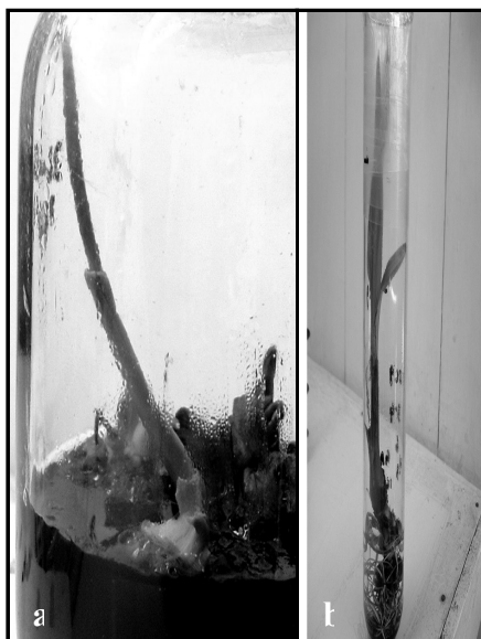
Figure 1. Developing shoots in germination medium containing GA 3 . a. A shoot emerging from a somatic embryo b. A complete plantlet with a well developed root system

In all 5 procedures (P 1 - P 5 ) tested, very poor shoot formation was observed even after repeated sub-culturing of somatic embryos into the germination medium. GA 3 has been used at a concentration of 0.35 \mu M to enhance germination of zygotic embryos of coconut (Weerakoon et al. , 2002). Thus all the embryogenic structures (obtained by the 5 procedures) were sub-cultured into a germination medium supplemented with 0.35 \mu M GA 3 . Shoot formation (Figure 1a & b) was improved by GA 3 application and the number of shoots increased with continuous exposure to GA 3 for all subsequent sub-culturing into the germination medium. The percentages of shoot production in each procedure are summarized in Table 1.