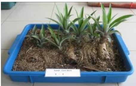
T1 – sand : coir dust (1:1)

The Plate 1 shows the variation in shoot growth of pineapple in different propagation media