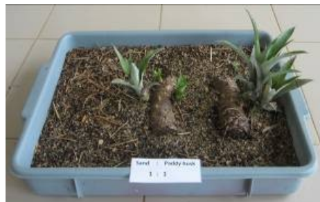
T2 – sand : partially burnt paddy husk (1:1)