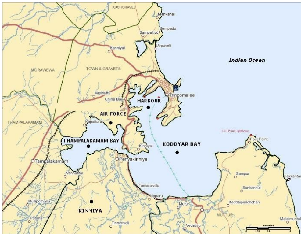
Fig. 3. Location of Kinniya, Thampalakamam bay, Koddyar bay, Air Force Base and harbour in Trincomalee District

Geographical nature of Kinniya facilitates fisheries activities with the possession of two important fishing grounds such as Thampalakamam bay in northern boundary of Kinniya and Koddyar bay in eastern boundary (Fig. 3). Traditionally, these two bays have been supporting the livelihood of coastal dwellers of Kinniya, next to agriculture.