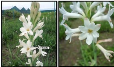
Mutant 3 (With 1.2 Kr X-rays treatment in cv Prajwal)