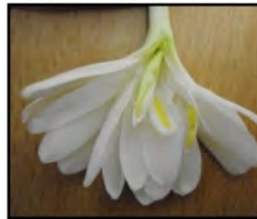
Mutant 5 (With 1.2 Kr X-rays treatment in cv Suvasini)