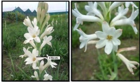
Mutant 3 (With 1.2 Kr X-rays treatment in cv Prajwal)