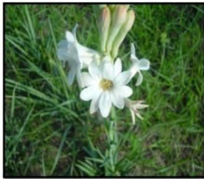
Mutant 4 (With 0.2 per cent EMS treatment in cv Prajwal)