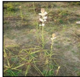
Mutant 6 (With 0.2 per cent EMS treatment in cv Prajwal)