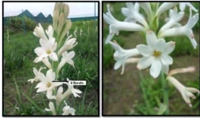
Mutant 3 (With 1.2 Kr X-rays treatment in cv Prajwal)