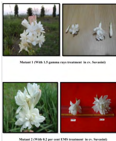
Photo 2. Mutants of Tuberose cv Suvasini