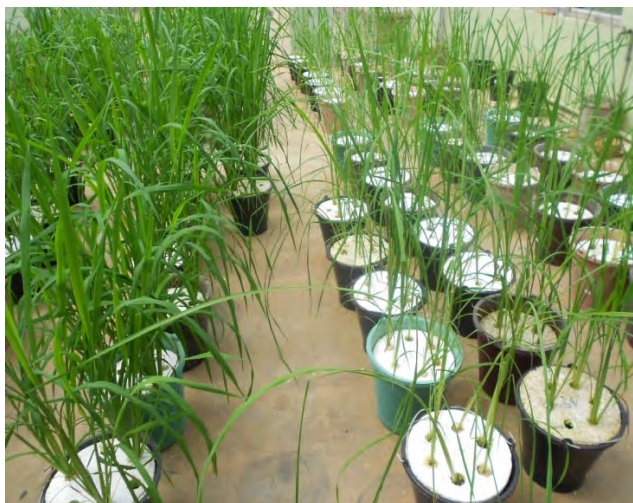
Plate 1. Plants in the green house at 40 days of age

Growth medium was maintained at pH of 5.6-5.8 by adjusting pH in every 2 days and solution was replaced once a week. Design of the experiment was a Complete Randomized Design with 3 replicates and data collected were; days to tillering, shoot and root dry weight and shoot P concentration. At tillering stage of each variety, plants having only 2 tillers per plant were harvested. Shoots and roots of harvested plants were separated, oven dried at 80 °C for 72 h and dry weights were measured.